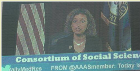
Rep. Debbie Wasserman Schultz

Ranking Democrat of the House Appropriations Subcommittee on Labor, Health and Human Services and Education (LHHS) Rep. Rosa DeLauro (CT) and Ranking Democrat on the House Budget Committee Rep. Chris Van Hollen (MD) spoke at the Rally. Van Hollen's district includes the NIH. "When they see a grassroots movement rising up, from doctors, from scientists, from advocates and patients, you are impossible to ignore," DeLauro told Rally participants. Van Hollen focused his remarks on the detrimental impact the sequester will have on scientific research. There were also statements of support from President Obama, Democratic National Committee chairwoman Rep. Debbie Wasserman Schultz (FL), and Sen. Jerry Moran (R-KS).