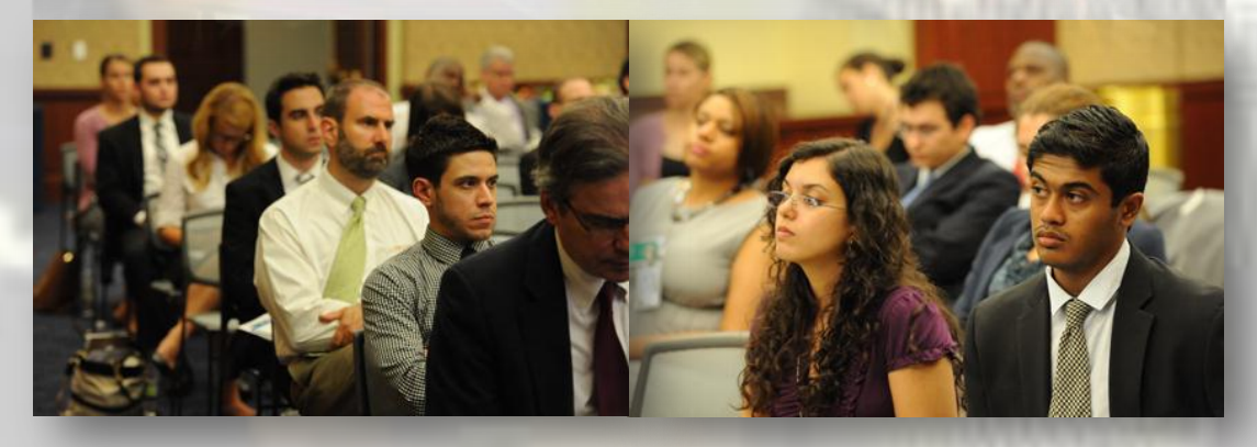
Presented by the Friends of NIDA, of which COSSA is a member.